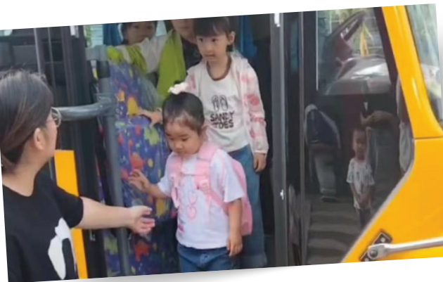
孩子排隊下車 Students lining up to get off the school bus