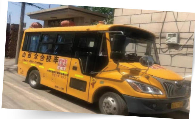
新購的正規校車 The new standard school bus