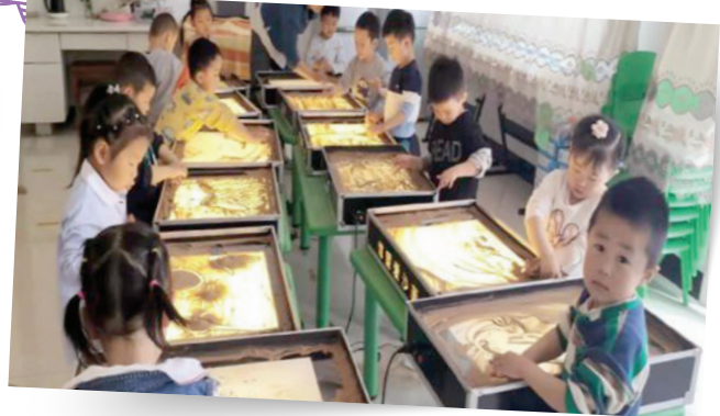
美術課－學習沙畫 Sand painting lesson

在過去一年，國內服務計劃辦公室的項目，主要有以下七大類： During the year, Mainland Service Desk assisted in seven funding projects: