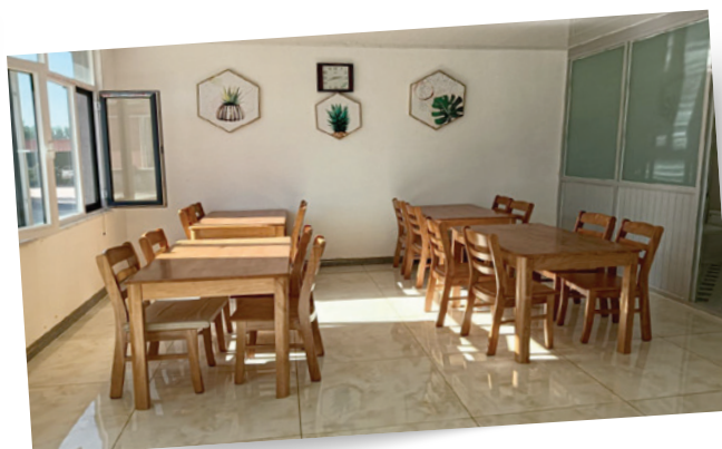
資助天津老人院購置設備 Sponsor a nursing home in Tianjin to purchase furniture