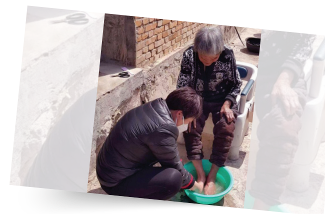
資助陝西居家服務－義工為無依老人洗腳 Sponsor the home care service in Shaanxi