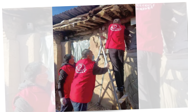
資助山西義工隊為獨居長者修理房屋 Volunteers in Shanxi helping to fix the house of a singleton elderly in a remote village