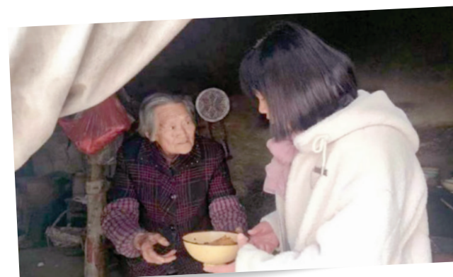
資助陝西居家服務－義工為貧困老人送飯 Sponsor the home care service in Shaanxi