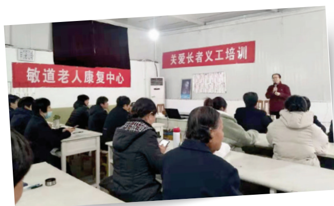
資助專責探訪長者的義工接受技術培訓 Sponsor the training of volunteers for home care service