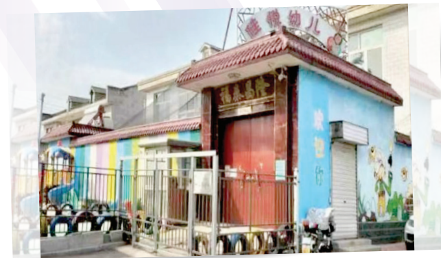
佳悅幼兒園 Jia Yue Kindergarten