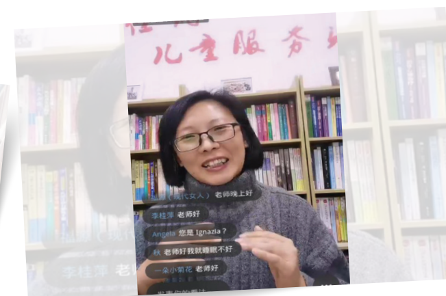
資助遼寧網上心理輔導服務 Sponsor the online counselling service for low-income families in Liaoning