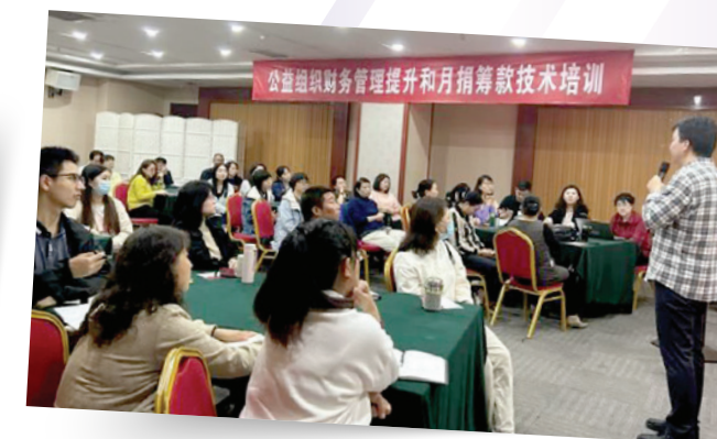
資助國內社服機構接受籌款技術培訓 Sponsor the social services organizations in Mainland to receive training on fundraising