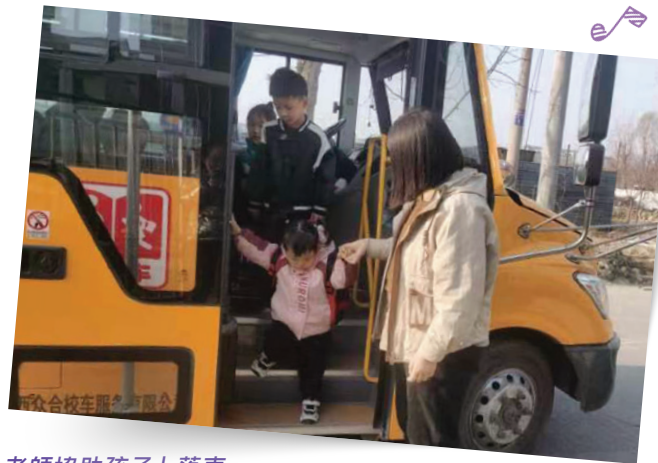
老師協助孩子上落車 A teacher helping students to get off the school bus