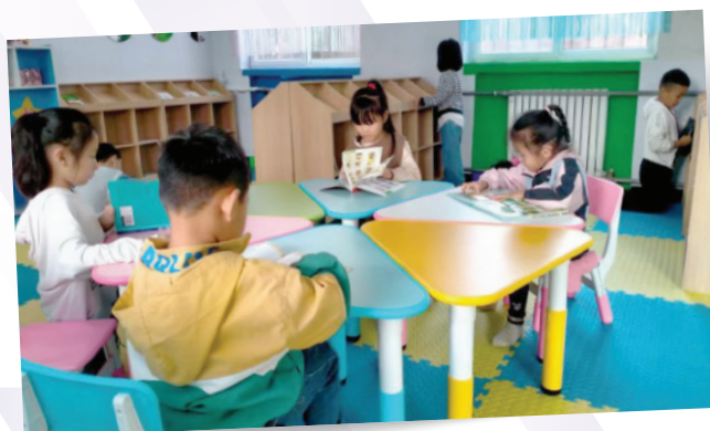
資助河北幼兒園購置設備，成立圖書角 Sponsor a kindergarten in Hebei to set up a children library